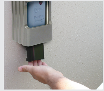
4. Obtain the key from the released key container.