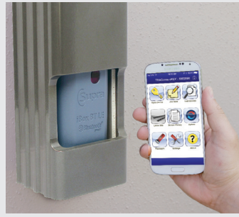
2. Tap Open Device .