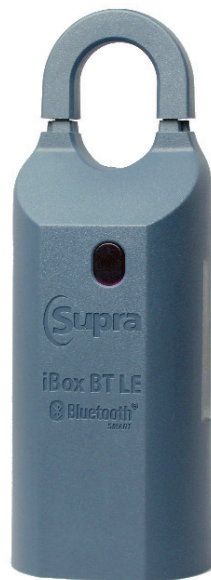
TRAC-Box BT Smart with overmold shackle