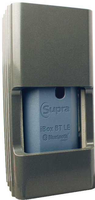
TRAC-Box BT Smart with heavy-duty housing

TRACcess® wireless key container includes either housing or protected shackle