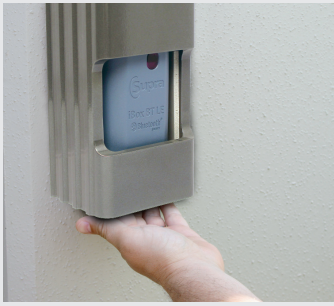
1. Turn on the Bluetooth.