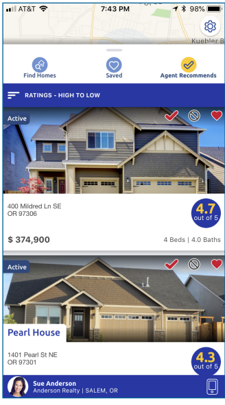
Easy for buyers to compare and track rated homes